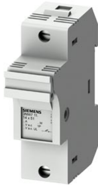
SENTRON, cylindrical fuse holder, 14x51 mm, 1-pole, In: 50 A, Un AC: 690 V