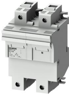
SENTRON, cylindrical fuse holder, 22x58 mm, 1P+N, In: 100 A, Un AC: 690 V