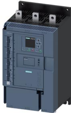
SIRIUS soft starter 200-480 V 570 A, 24 V AC/DC spring-type terminals