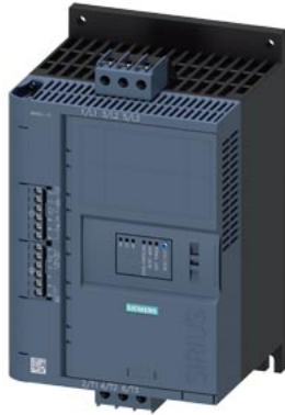
SIRIUS soft starter 200-480 V 32 A, 110-250 V AC Screw terminals Thermistor input