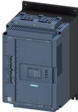
SIRIUS soft starter 200-480 V 63 A, 110-250 V AC Screw terminals Thermistor input