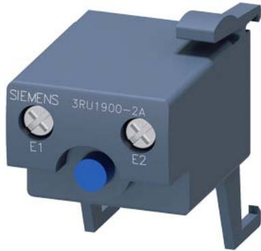
Electronic remote reset 24...30 V AC/DC for 3RU Size S00...S3