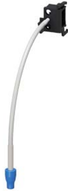
Cable release for reset 0.6 m for 3RU2 Size S00...S3