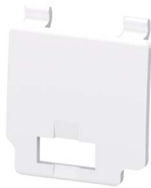
scale cover, sealable for circuit breaker 3RV2 Size S00...S3