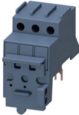
Disconnecter module for circuit breaker Size S00/S0