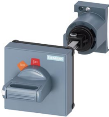
Door-coupling rotary operating mechanism For circuit breaker Size S00...S3, black 130 mm shaft