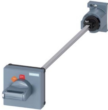
Door-coupling rotary operating mechanism For circuit breaker Size S00...S3, black 330 mm shaft