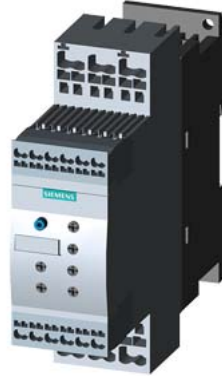
SIRIUS soft starter S0 32 A, 15 kW/400 V, 40 °C 200-480 V AC, 110-230 V AC/DC spring-type terminals