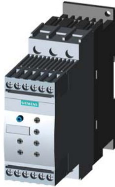
SIRIUS soft starter S0 25 A, 11 kW/400 V, 40 °C 200-480 V AC, 24 V AC/DC Screw terminals