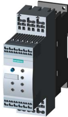
SIRIUS soft starter S0 25 A, 11 kW/400 V, 40 °C 200-480 V AC, 24 V AC/DC spring-type terminals