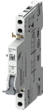
Auxiliary current switch 1 CO For MCB 5SL, 5SY, 5SP Incorporated switch 5TL1 RCBO 5SU1, RC 5SV