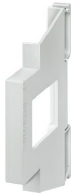
Spacer 0.5 MW