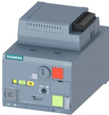
SEO motor operator 24-60V AC/DC accessory for: 3VA2 100/160/250