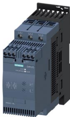
SIRIUS soft starter S2 45 A, 22 kW/400 V, 40 °C 200-480 V AC, 110-230 V AC/DC Screw terminals